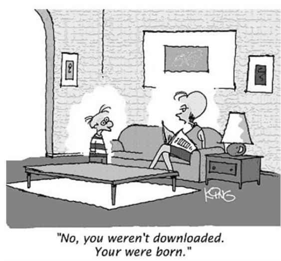
Figura 1. A typical figure

Figure and table captions should be centered if less than one line (Figure 1), otherwise justified and indented by 0.8cm on both margins, as shown in Figure 2. The caption font must be Helvetica, 10 point, boldface, with 6 points of space before and after each caption.